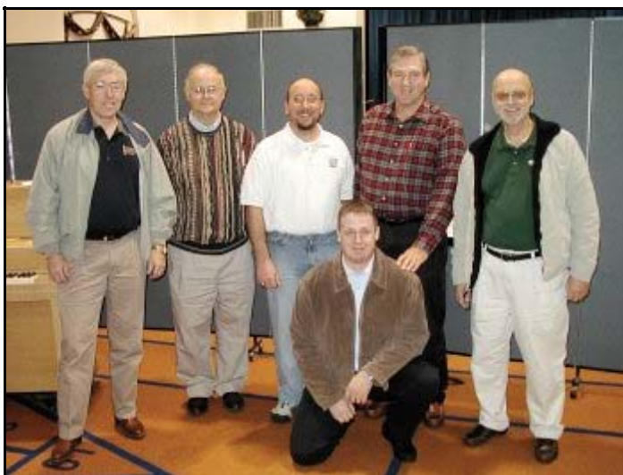
Guests at December 12, 2002 Chapter Meeting

I know from experience over many years that the Manhattan Chapter has enjoyed the services of many fine chapter secretaries. These predecessors have maintained the records necessary to assure our continued proper existence. I feel confident that our "legal operation" is as good if not superior to the best chapters within the district and society. I feel confident in reporting to you that from a legal standpoint, the Manhattan Chapter is in great shape. It is my personal hope to continue this tradition of excellent service that our chapter has enjoyed over its 26 years of existence.