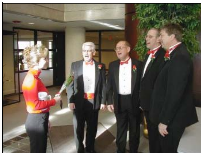
Manhattan Music Machine delivering a Valentine February 14, 2002

Singing Valentine$ 2003 February 13 and 14 call 785-539-6333