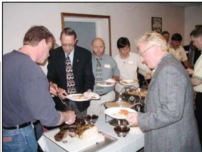
Serving line at last year's banquet -- lots of delicious food