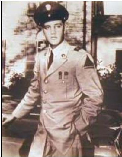
Elvis on one of the 5 six and one-half by eight foot posters