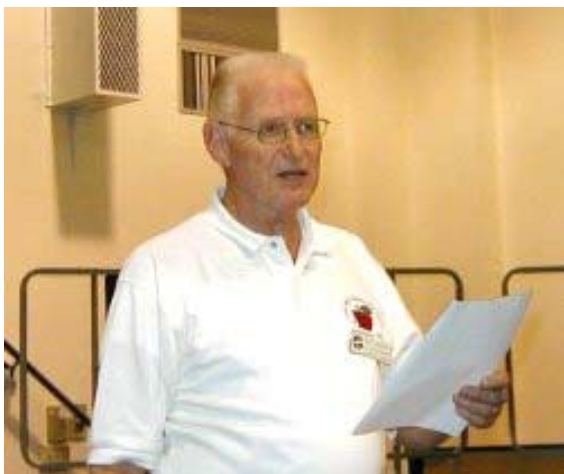
Co-Chapter Development VP giving