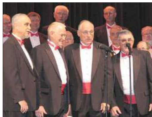
Apple Core ete