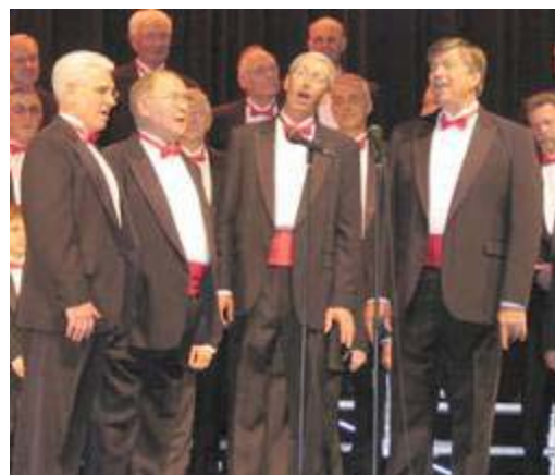
Manhattan Music Machine