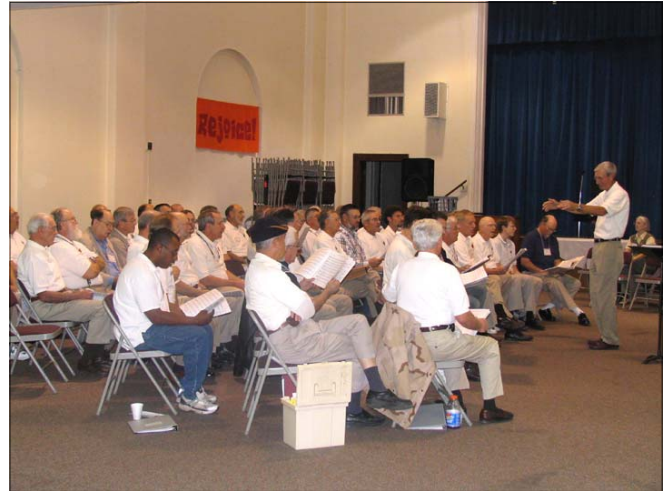
Guest and chorus members at guest night