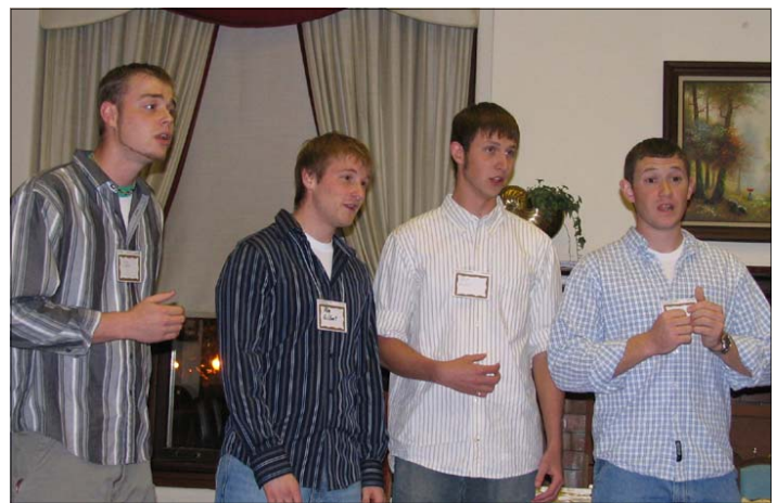
Guest quartet DOWNPOUR entertained the ladies and chorus members at guest night.