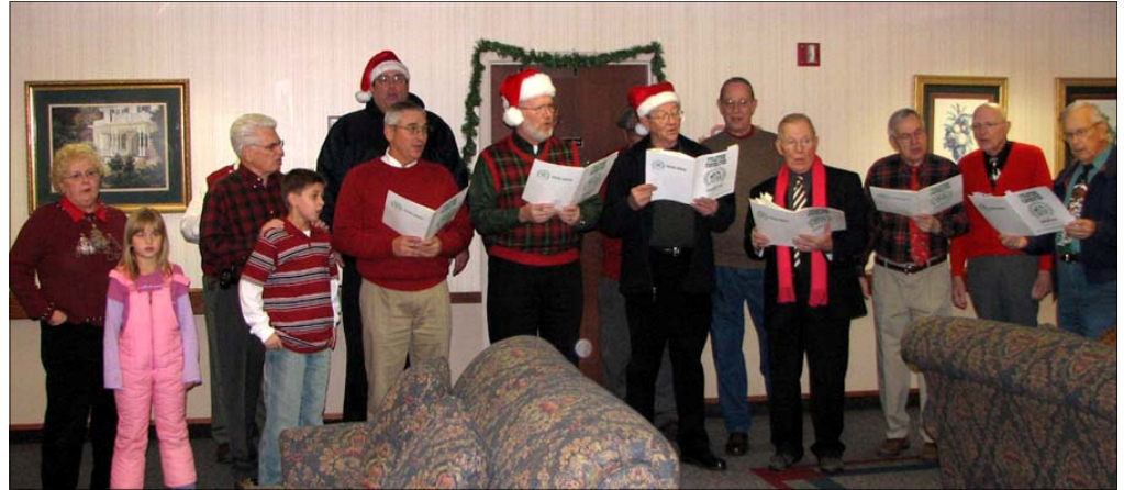
We have pictures of two of the three groups singing at area care homes on December 13. The top photo is at Meadowlark and the bottom photo is at one of the homes at Stoneybrook.