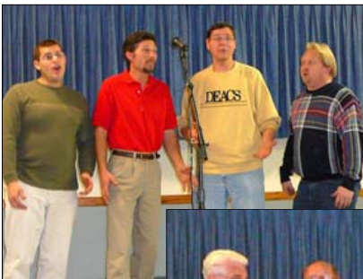
Late Night Edition and the Manhattan Music Machine