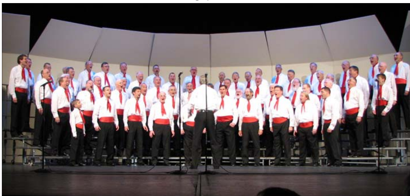
Members of the Little Apple Chorus in the last half of the 2007 show.