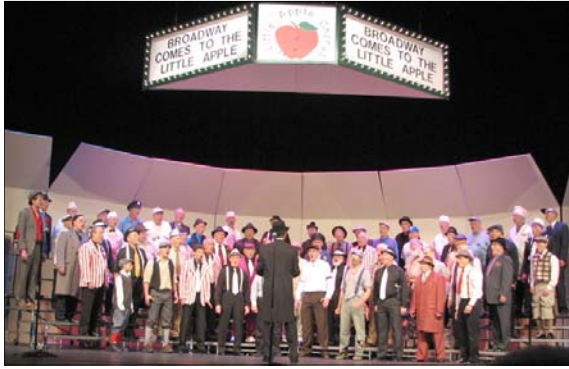
The Little Apple Chorus sings out at the Spring show under the great marquee.