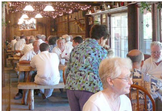
Members and wives of the Little Apple Chorus enjoy a summer picnic at Black Jack Recreation Cabin

July saw the LAC back in church again to sing 6 times between 8:30 and noon in 5 area Churches. Singing twice in the same Church within 3 hours must mean they really enjoy our singing! Let's take that as a compliment. After "Church" The LAC assembled at Black Jack Recreation for the annual Summer Picnic. Everyone was treated to a delicious meal of BBQ pork and a large assortment of desserts provided by the LAC La-