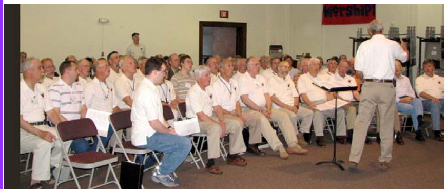
Members of the Chorus and their guests enjoy singing at Open house May 10th.

The chapter accepted the invitation to perform the National Anthem for the Kaw Valley Rodeo on Friday, July 25 at 8:00 p.m., Cico Park. The Rodeo has its " Tough Enough To Wear Pink " (TETWP) that evening during which money is collected for contributions to the Terry C. Johnson Center for Basic Cancer Research at K-State. This provides our chapter an opportunity to honor our country while performing our style of music harmony to a different audience!