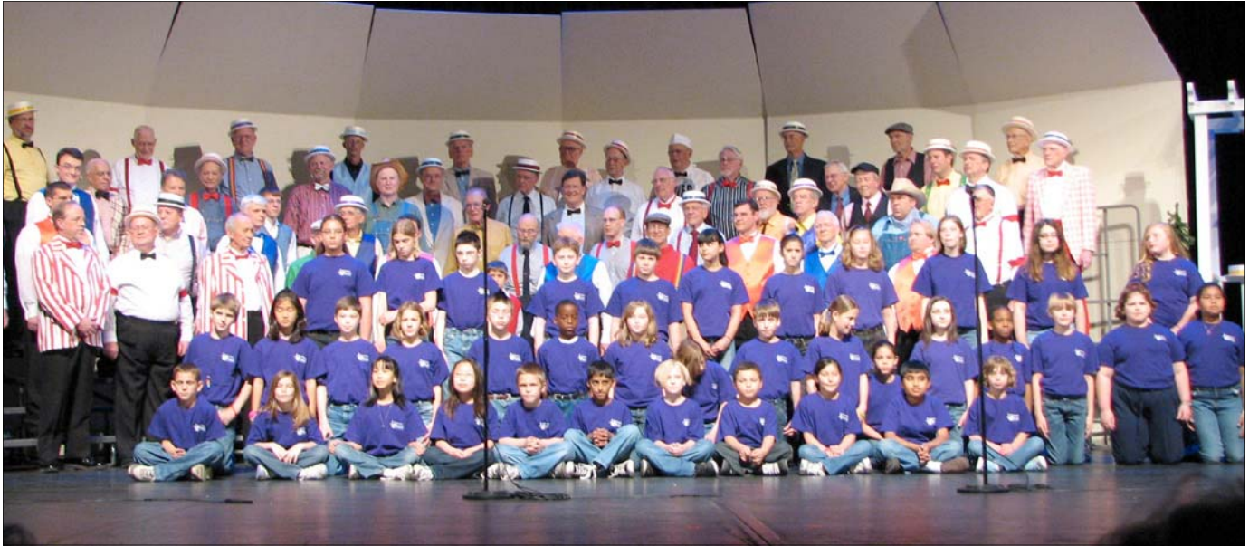
The Little Apple Chorus with Bergman Awesome Musicians from Bergman Elementary School.