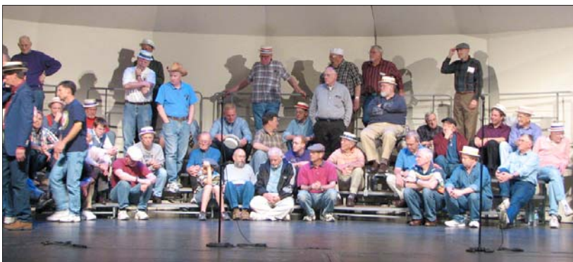
Chorus Members taking a needed break at tech rehearsal.