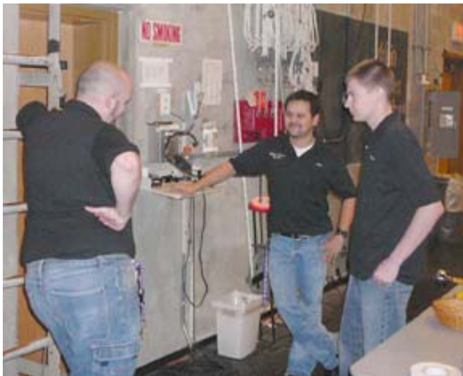
The stage crew is backstage waiting for the show to start. We could not do it without these men.