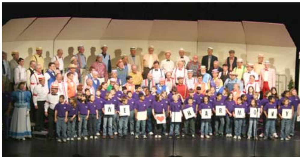
BAM and the Chorus declaring "We love Harmony".