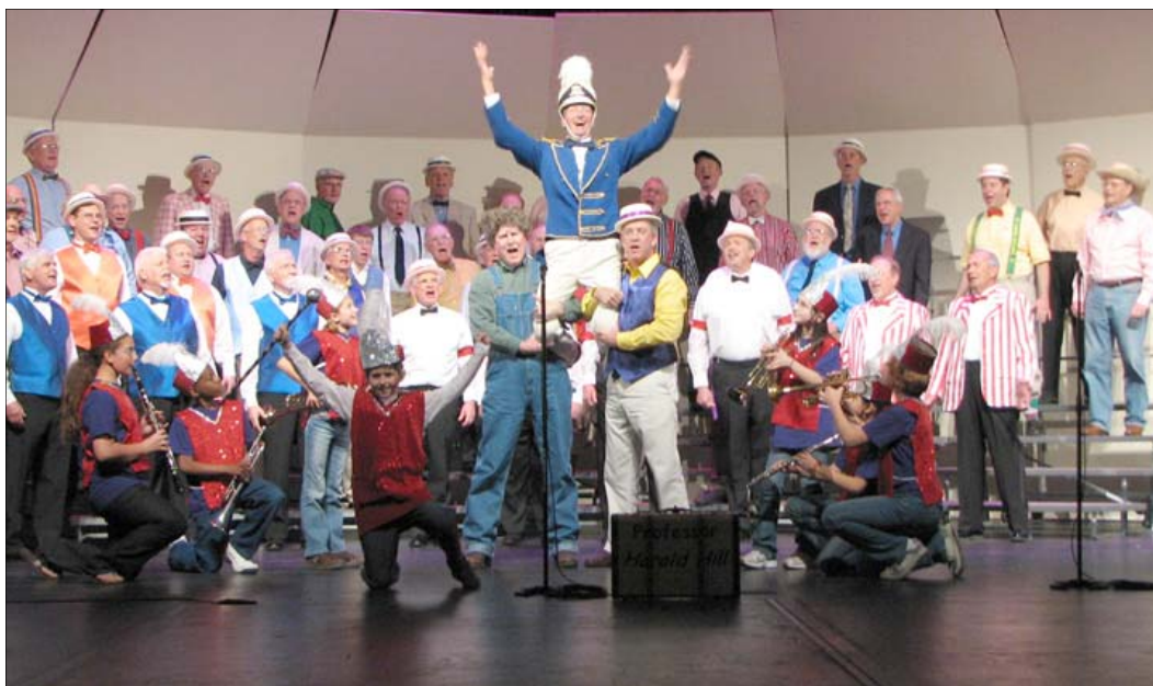
From who knows what to REALLY CLASSY