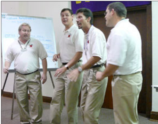
Late Night Edition entertained the group with a number from their contest performance. Below Manhattan Music Machine entertained the ladies or are they excited about the food?