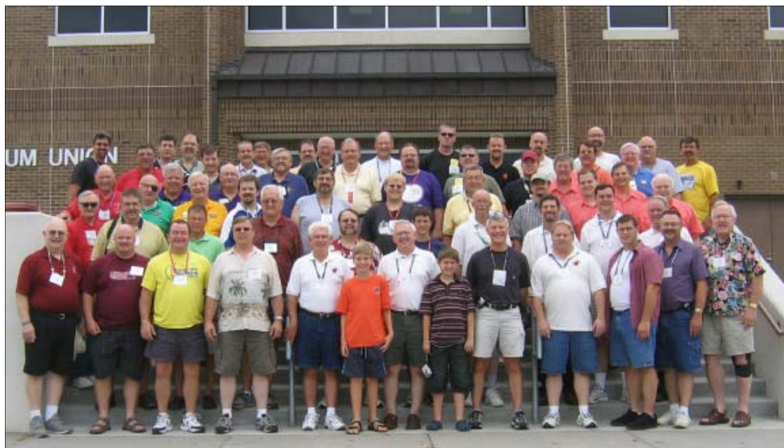
Central States District barbershoppers at 2008 Harmony University , Missouri Western State University, St. Joseph, Missouri.

See the Manhattan chapter members on the front two rows.