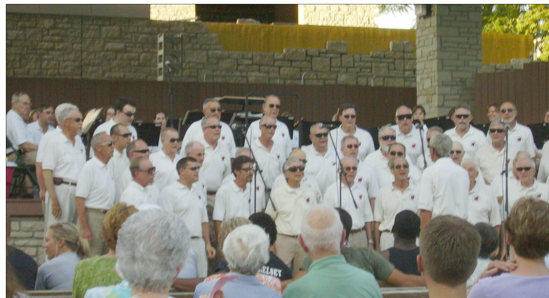
The Little Apple Chorus singing Barbara Ann, Tuesday June 23 at the invitation of the Manhattan Municipal Band at the Manhattan City Park – the Chorus and Band also jointly performed the Battle Hymn of the Republic