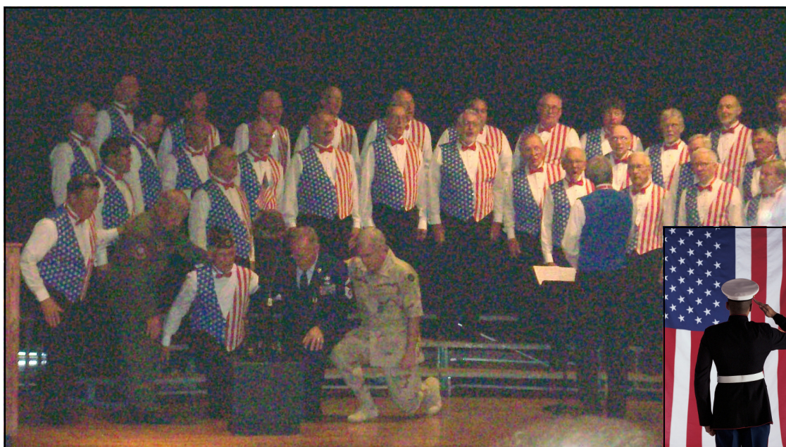
On June 6 the Little Apple Chorus performed for local veterans at a special D-Day program at the K-State Student Union.